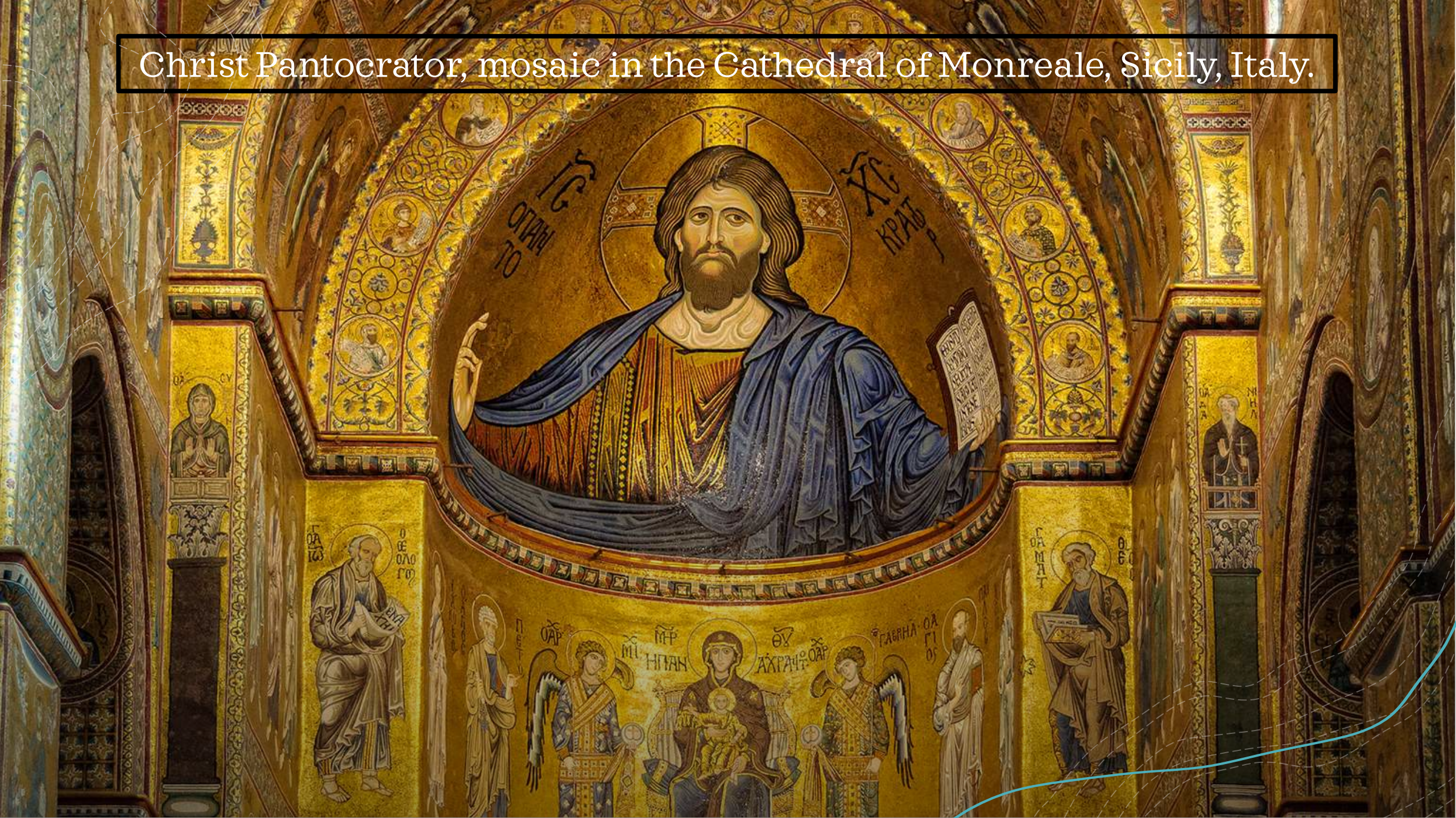
Christ Pantocrator, mosaic in the Cathedral of Monreale, Sicily, Italy.